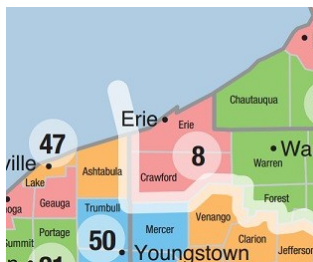
Erie Local Section of ACS

the area over the previous year and these included a mix of local speakers, non-local speakers and ACS webinars discussing various aspects of chemistry. The last meeting of the academic year is always our annual Awards Banquet in April and at this meeting we recognized local college students that excelled in the study of chemistry and local high school students that participated in the national Chemistry Olym-