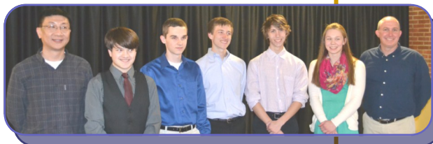
2014 Chemistry Olympiad Award Winners