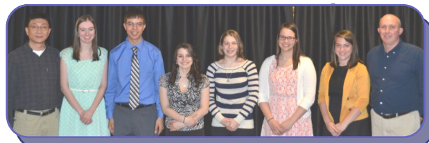
2014 Outstanding First Year Chemistry Award Winners

Ten top students who competed in the National Chemistry Olympiad received a 2014 Chemistry Olympiad Award .